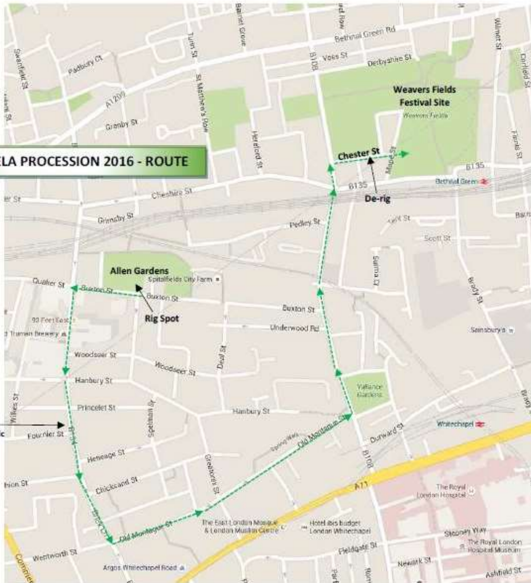
BOISHAKHI MELA PROCESSION 2016 - ROUTE